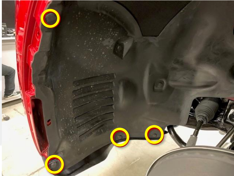
Figure 1 – Left front wheel removed for clarity