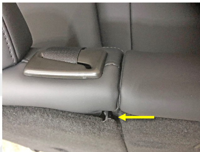
✗ Figure 2 – Example of excessive gap between LH seat back panel and seat