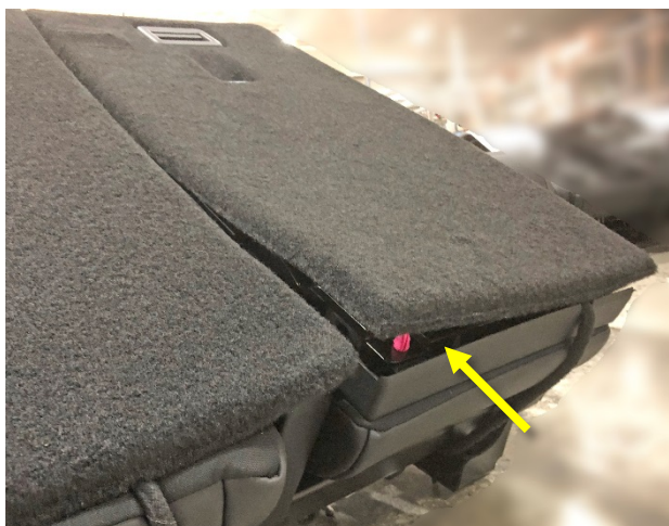
✗ Figure 1 – Example of excessive gap between center seat back panel and seat